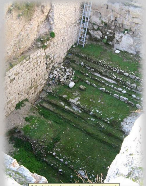
Bethesda: staircase in an exposed part of the southern pool

The LORD your God will raise up for you a prophet like me from among you, from your fellow Israelites. You must listen to him.