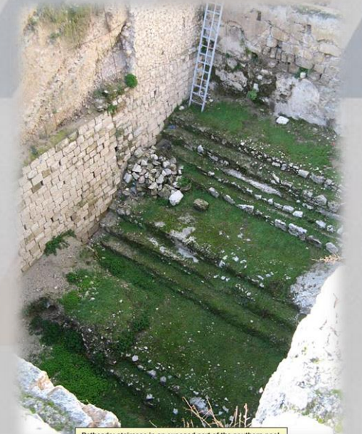
Bethesda: staircase in an exposed part of the southern pool

“And the Father who sent me has himself testified concerning me. You have never heard his voice nor seen his form, nor does his word dwell in you, for you do not believe the one he sent.”