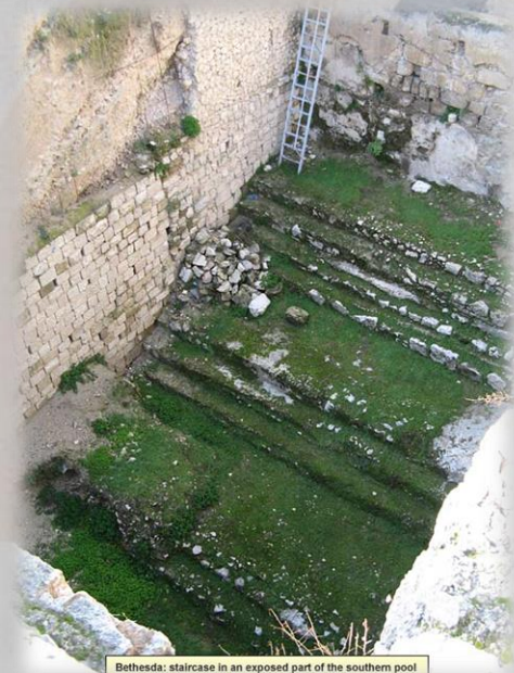
Bethesda: staircase in an exposed part of the southern pool

“I have testimony weightier than that of John. For the works that the Father has given me to finish—the very works that I am doing—testify that the Father has sent me.”