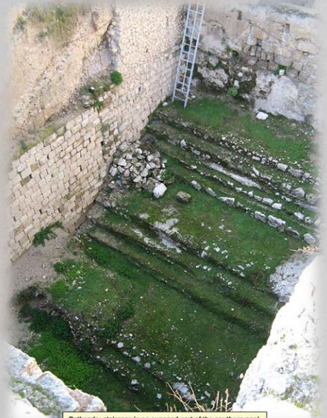
Bethesda: staircase in an exposed part of the southern pool

“You have sent to John and he has testified to the truth. Not that I accept human testimony; but I mention it that you may be saved. John was a lamp that burned and gave light, and you chose for a time to enjoy his light.”