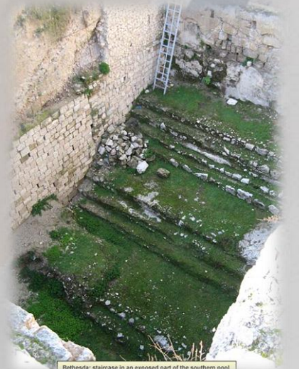
Bethesda: staircase in an exposed part of the southern pool

“Look, the Lamb of God, who takes away the sin of the world!”