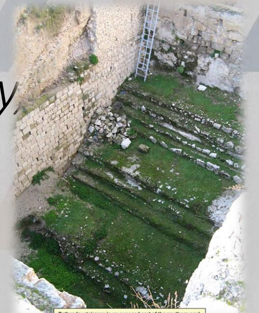
Bethesda: staircase in an exposed part of the southern pool

In his defense Jesus said to them, “My Father is always at his work to this very day and I too am working.”