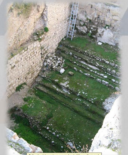
Bethesda: staircase in an exposed part of the southern pool

“Very truly I tell you, a time is coming and has now come when the dead will hear the voice of the Son of God and those who hear will live.”