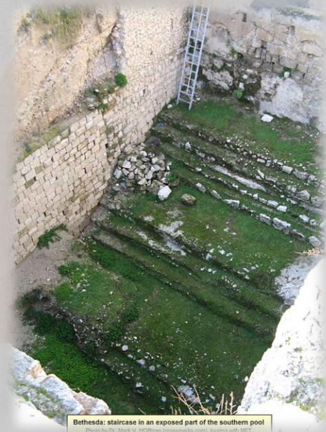
Bethesda: staircase in an exposed part of the southern pool

For just as the Father raises the dead and gives them life , even so the Son gives life to whom he is pleased to give it. Moreover, the Father judges no one, but has entrusted all judgment to the Son, that all may honor the Son just as they honor the Father. Whoever does not honor the Son does not honor the Father, who sent him.