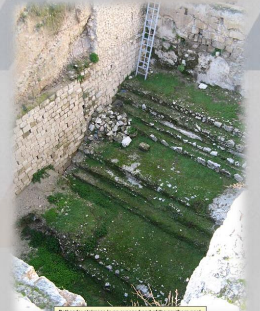
Bethesda: staircase in an exposed part of the southern pool

“Very truly I tell you, whoever hears my word and believes him who sent me has eternal life and will not be judged but has crossed over from death to life.”