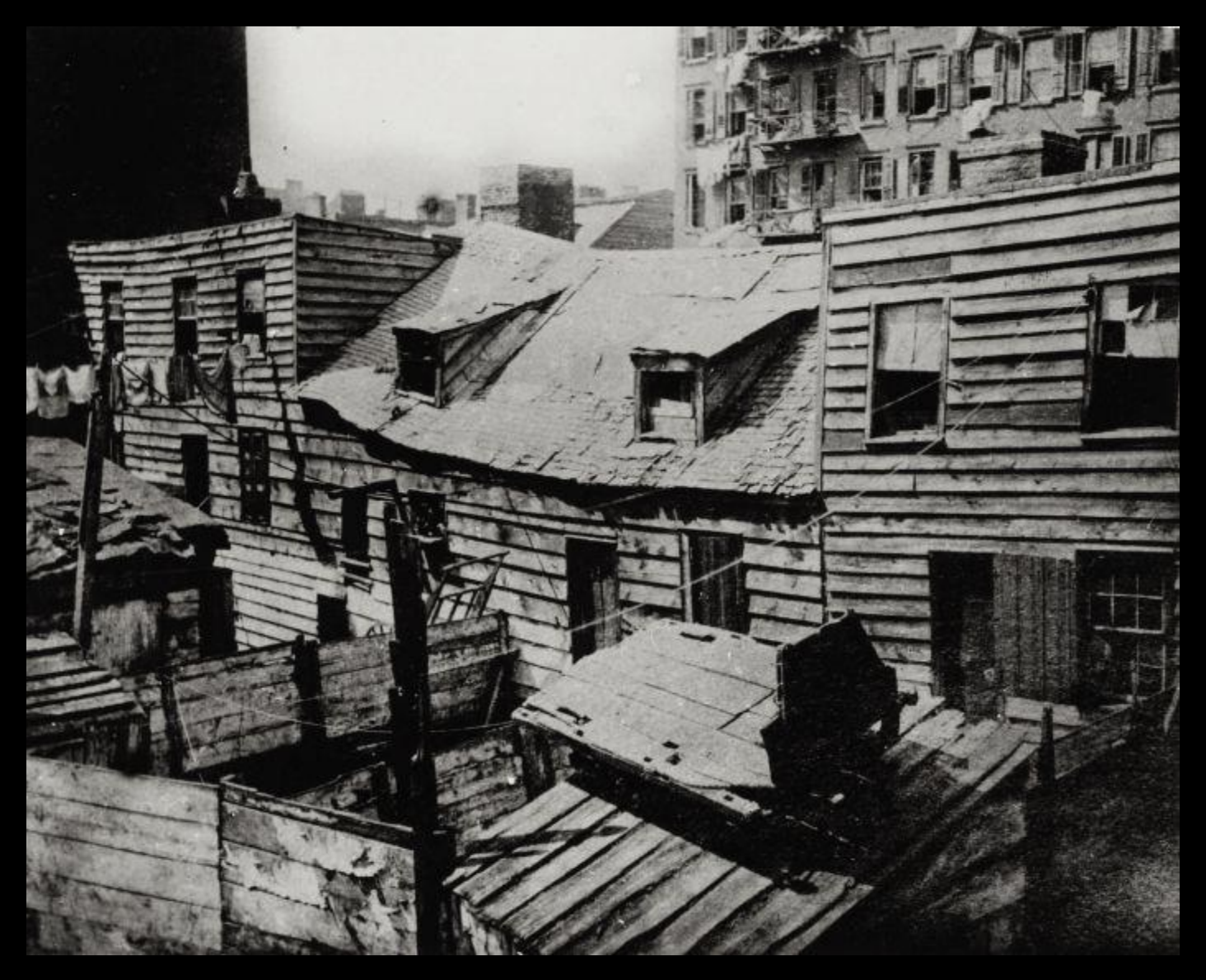
The "Dens of Death"