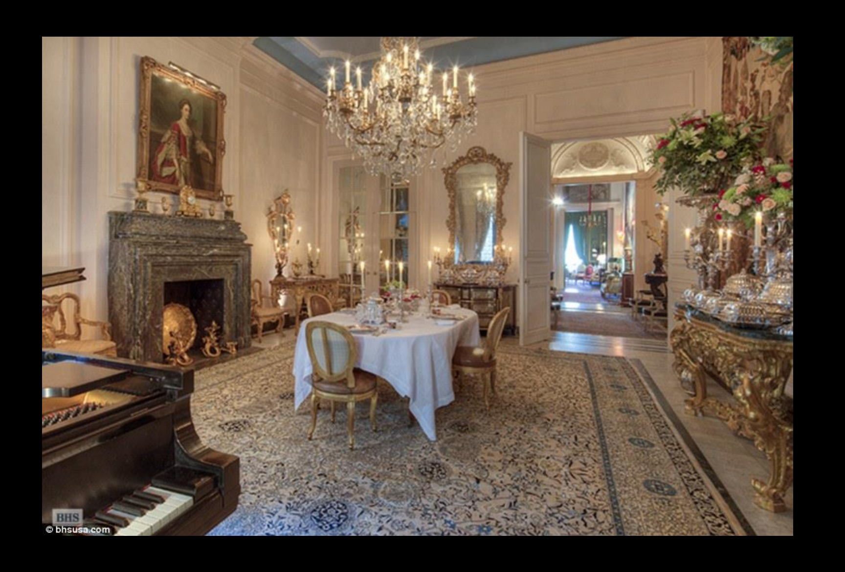
The Gilded Age