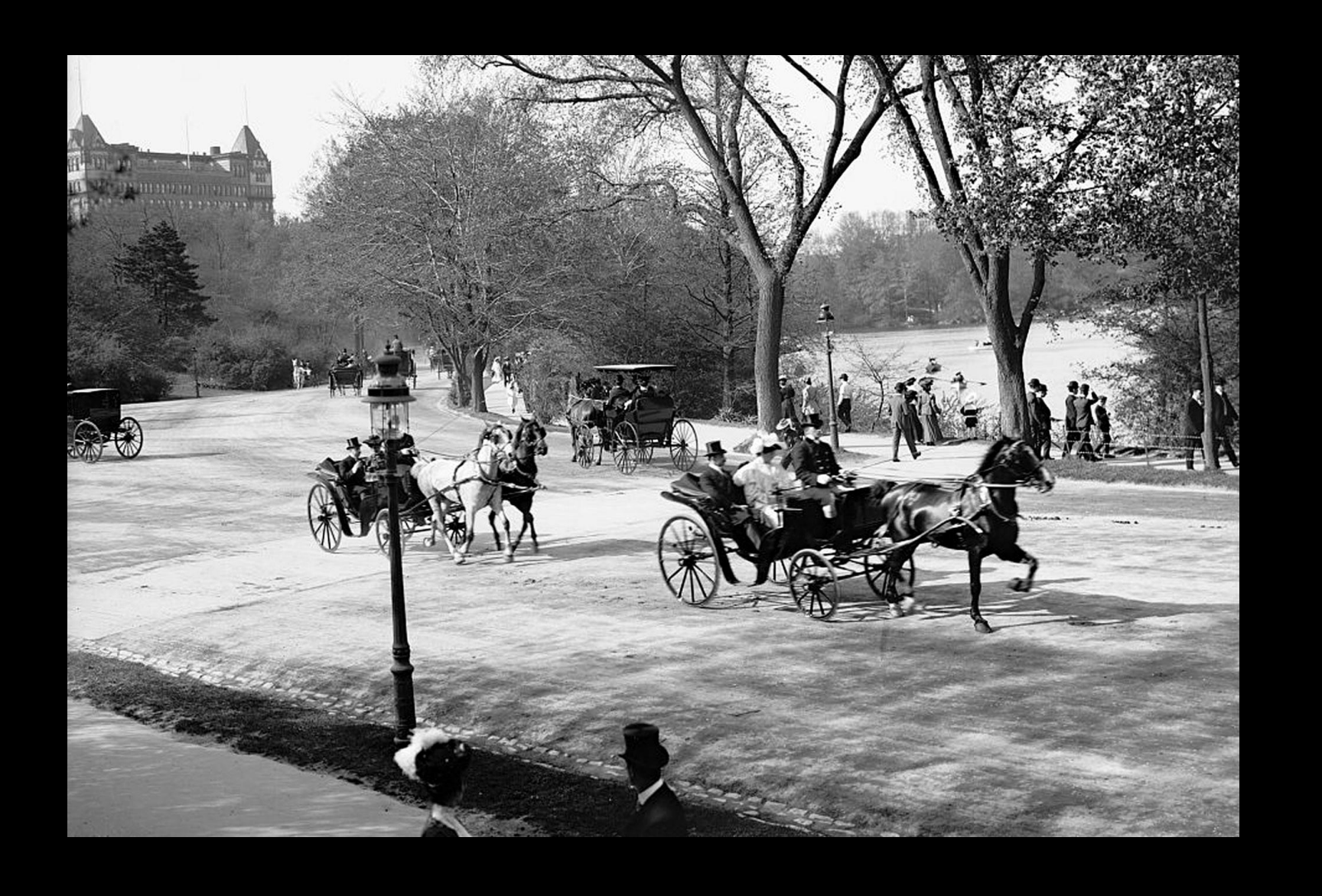
The Gilded Age