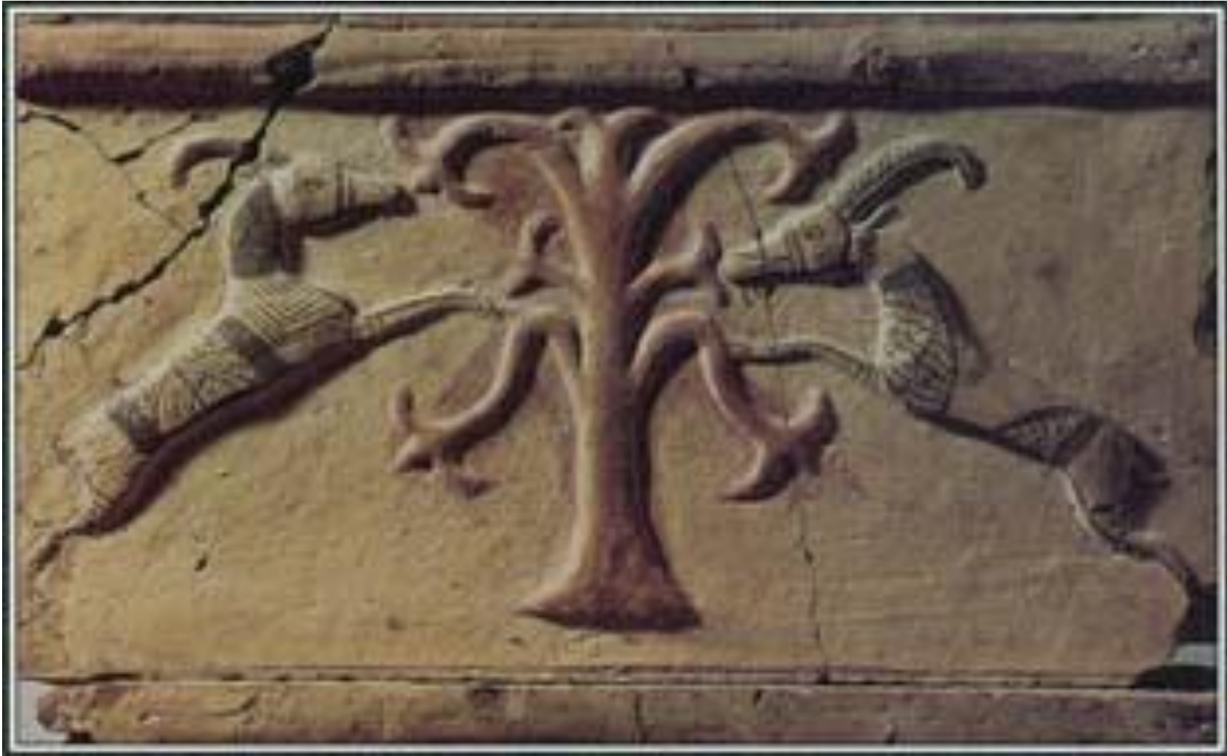
Ancient depiction of the Tree of Life