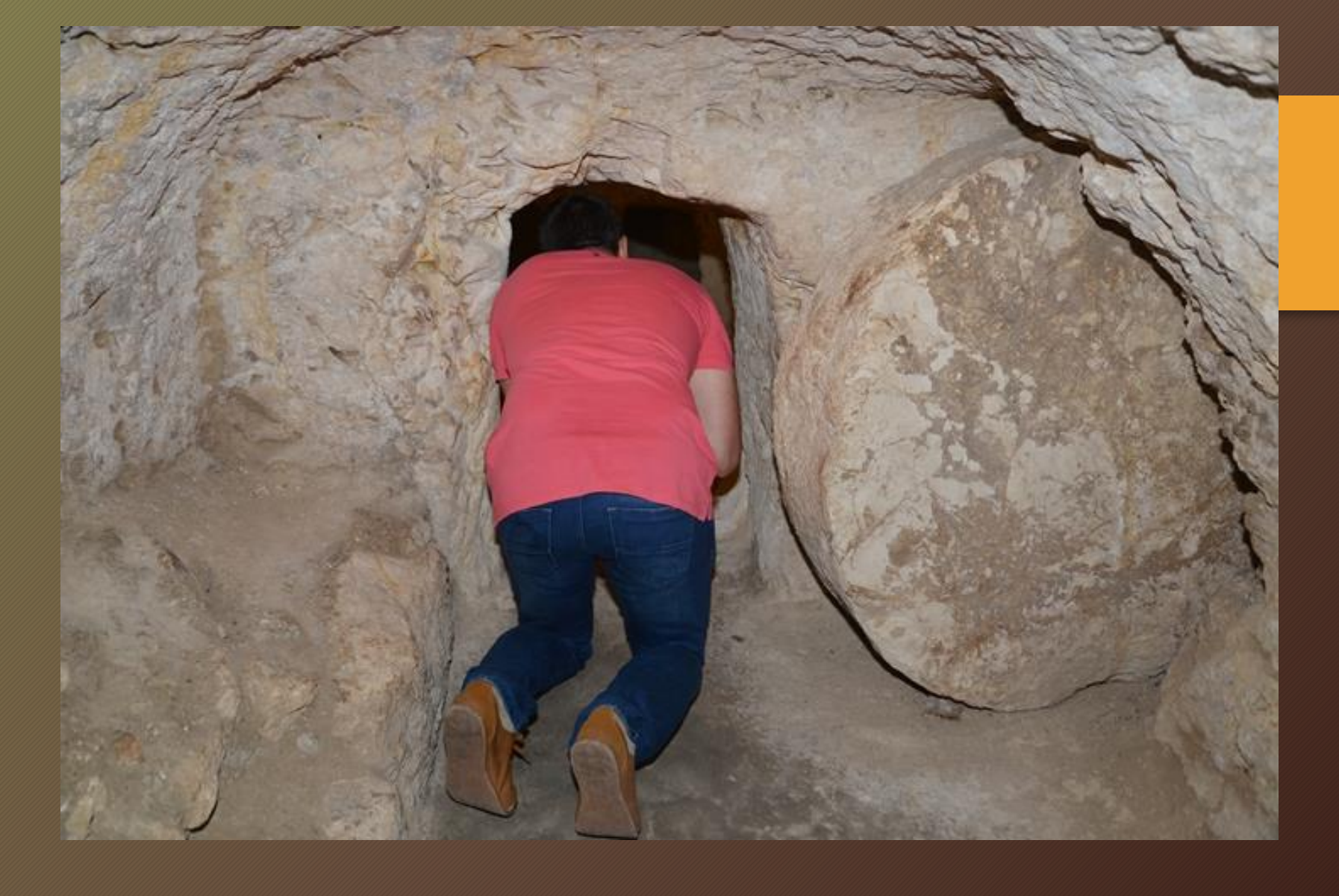
A tiny door!