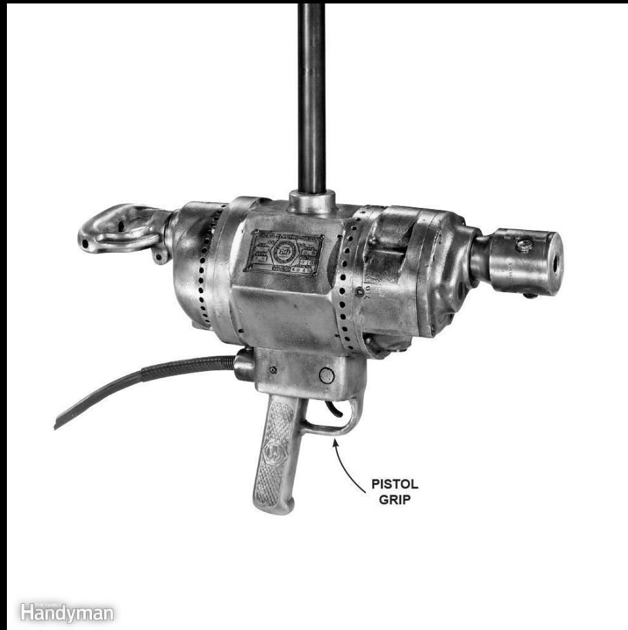
First portable drill: 1916