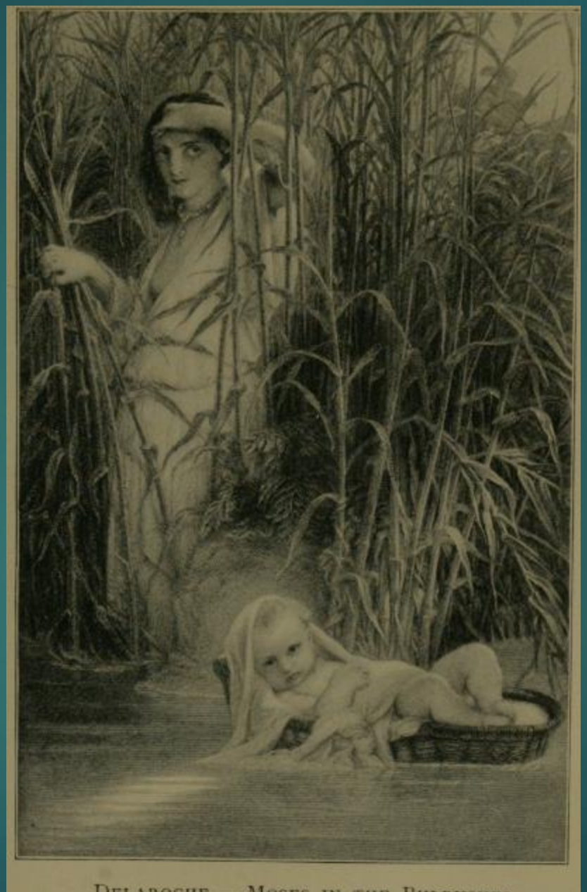
DELAROCHE. — Moses in the Bulrushes.