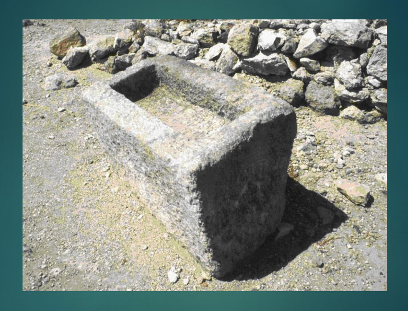
Ancient manger from Israel