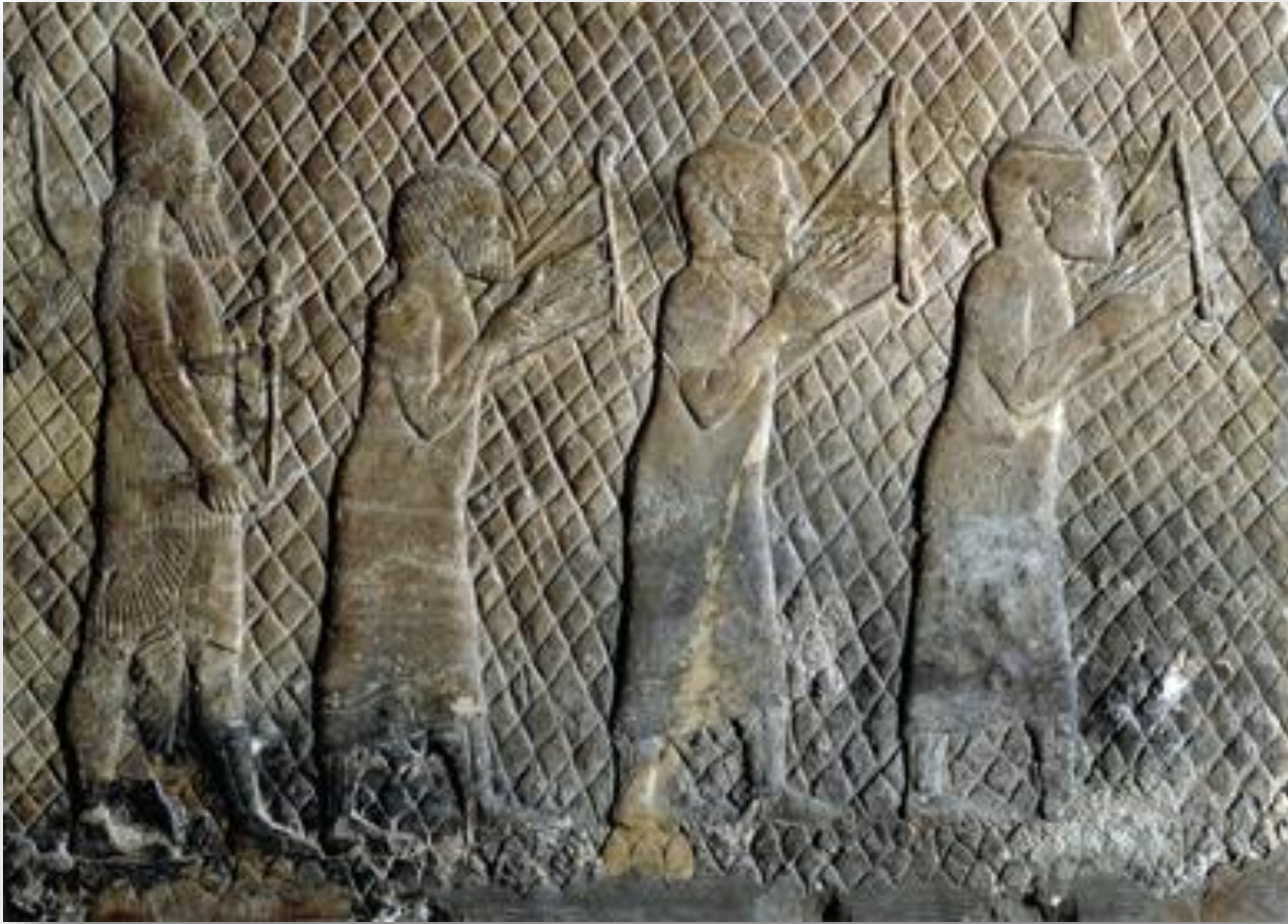
Palestinian prisoners playing harps, Nineveh