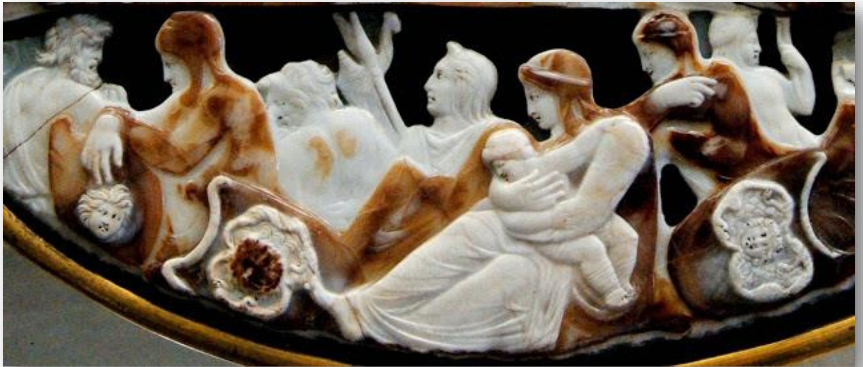
The Conquered: barbarians defeated