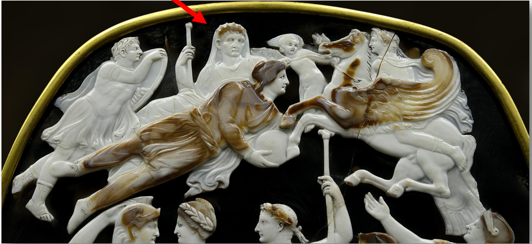
Heaven: Augustus as a god