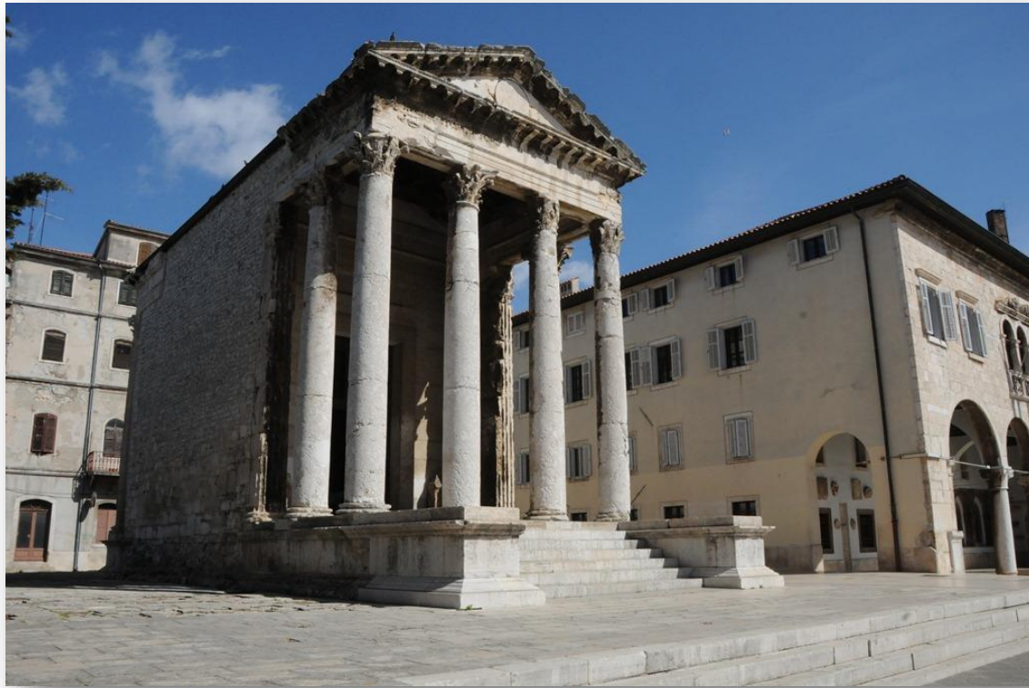
Temple to Augustus: Pula, Croatia Roma and Augustus Caesar, son of the deity, father of the fatherland