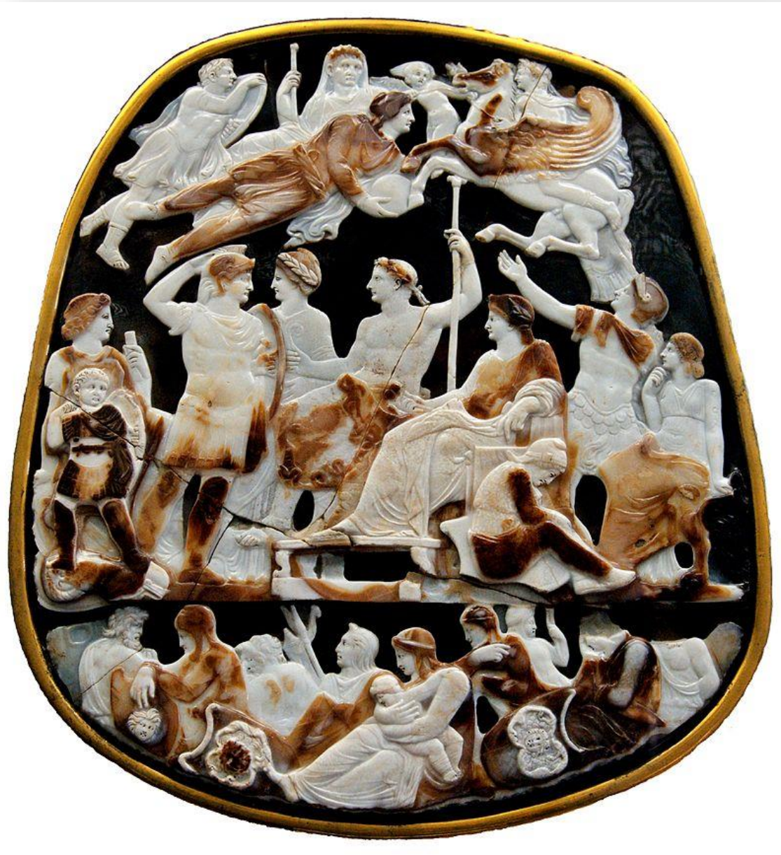
The Great Cameo of France