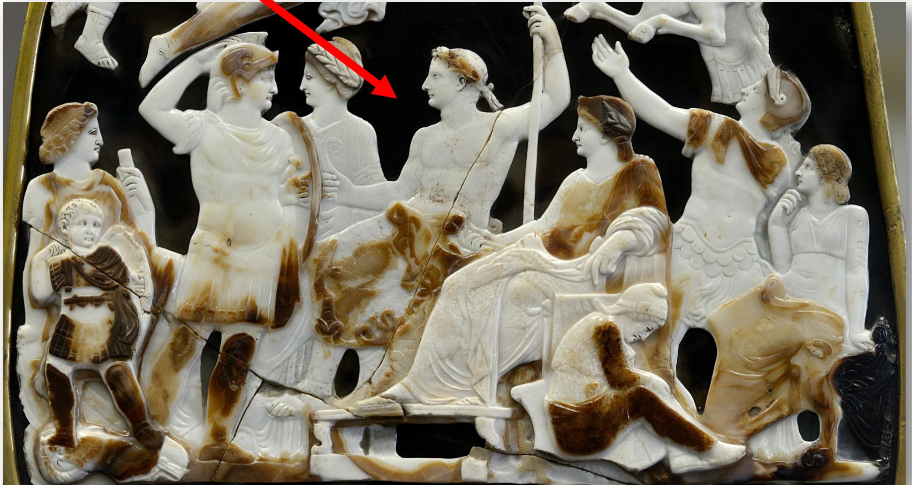
Palace: Tiberius as “son of god”