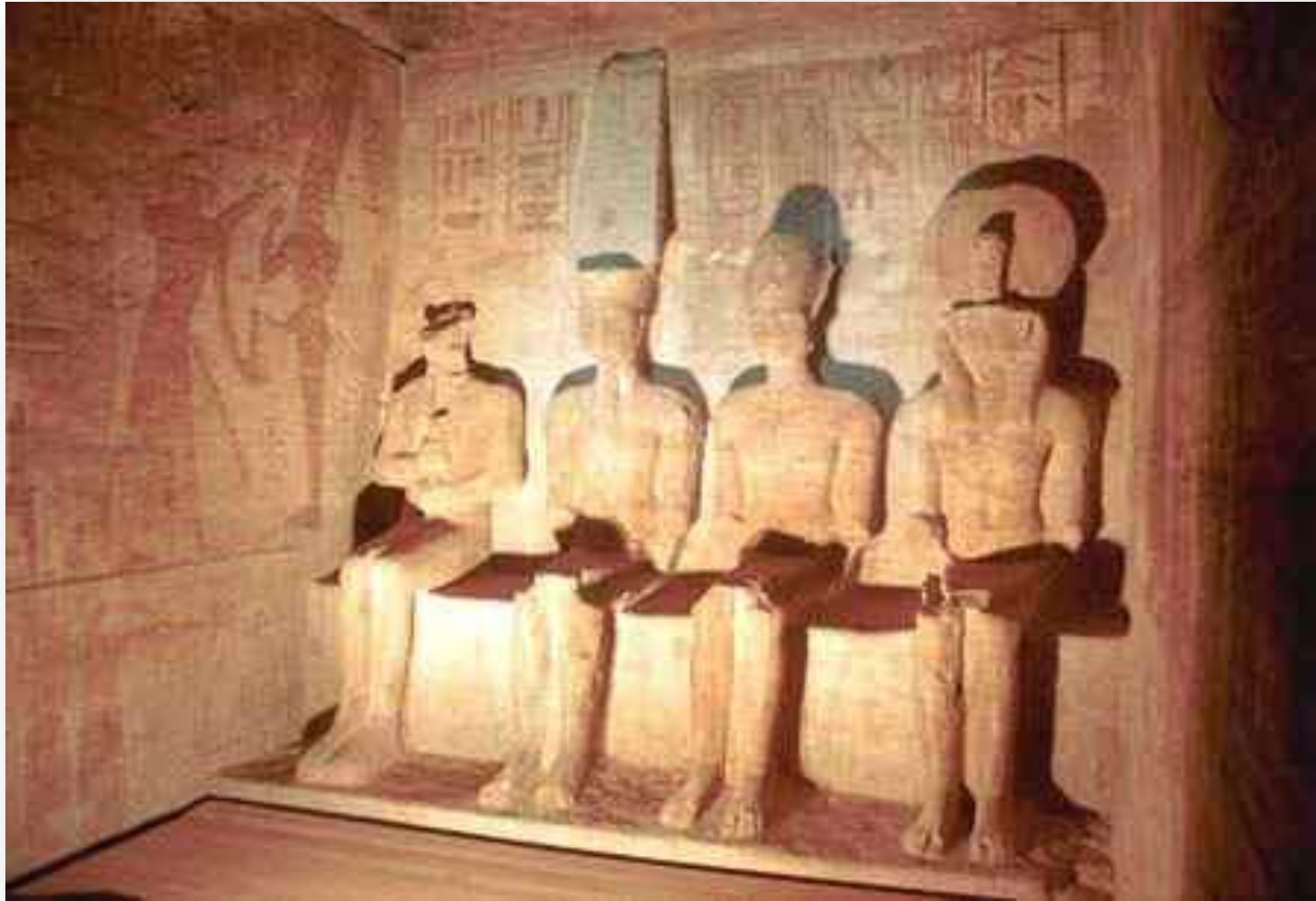
Sun illuminating inner chamber of temple.