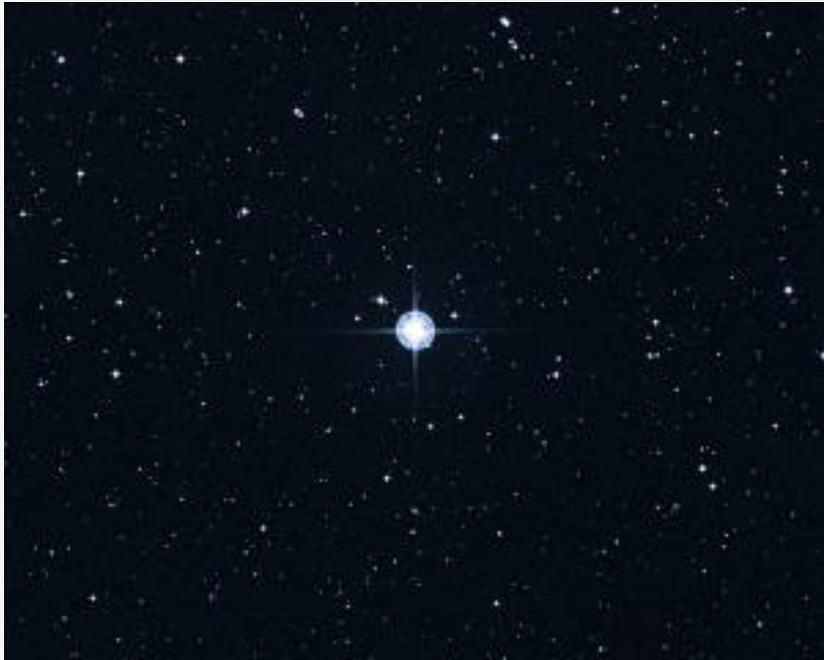
The Methusaleh Star