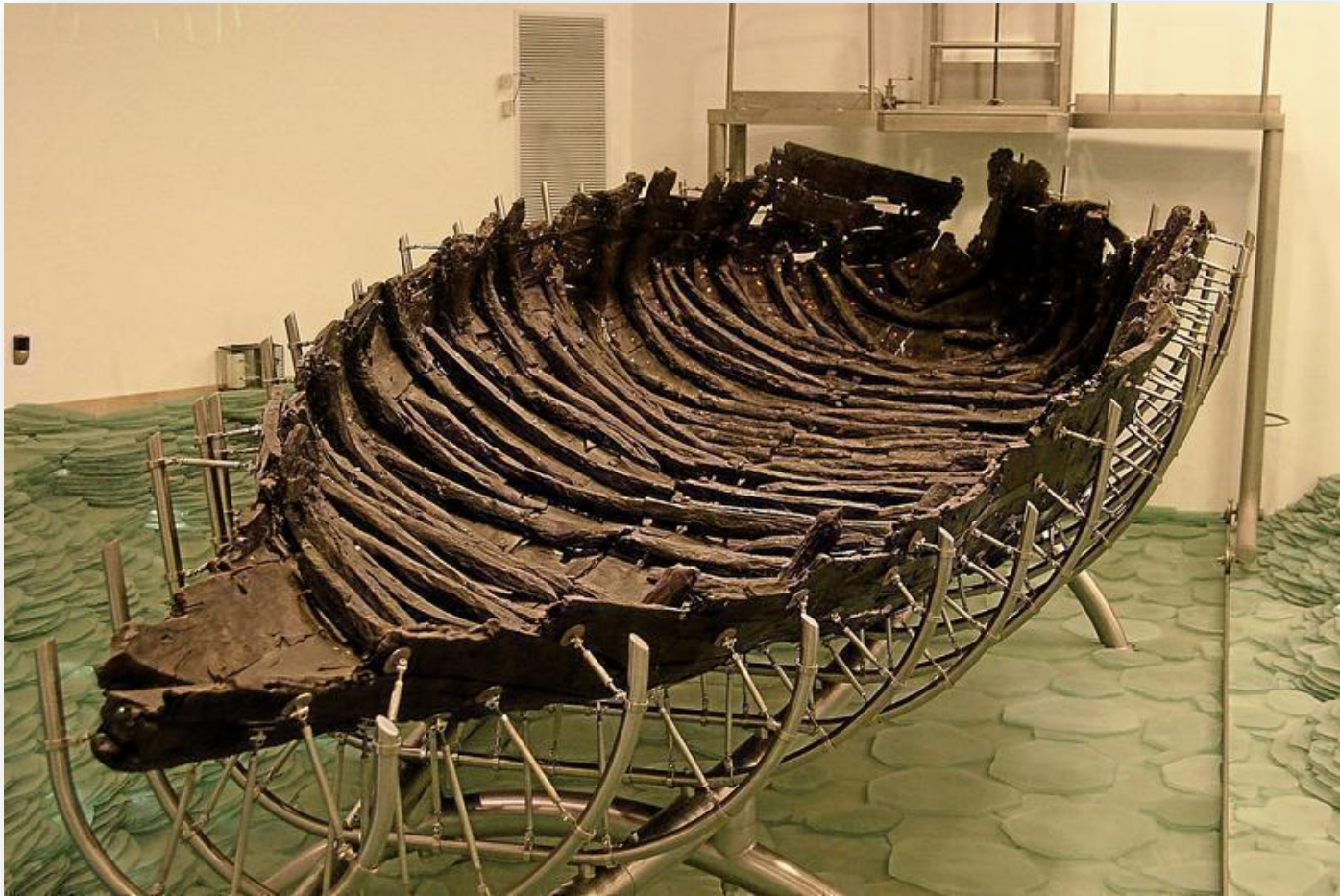
THE "JESUS BOAT"