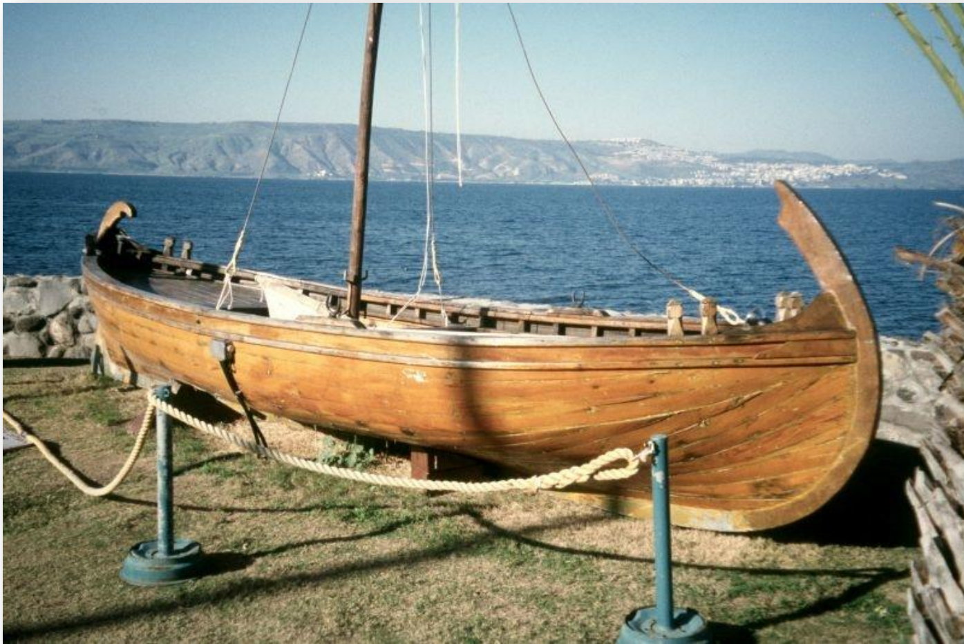
THE "JESUS BOAT"