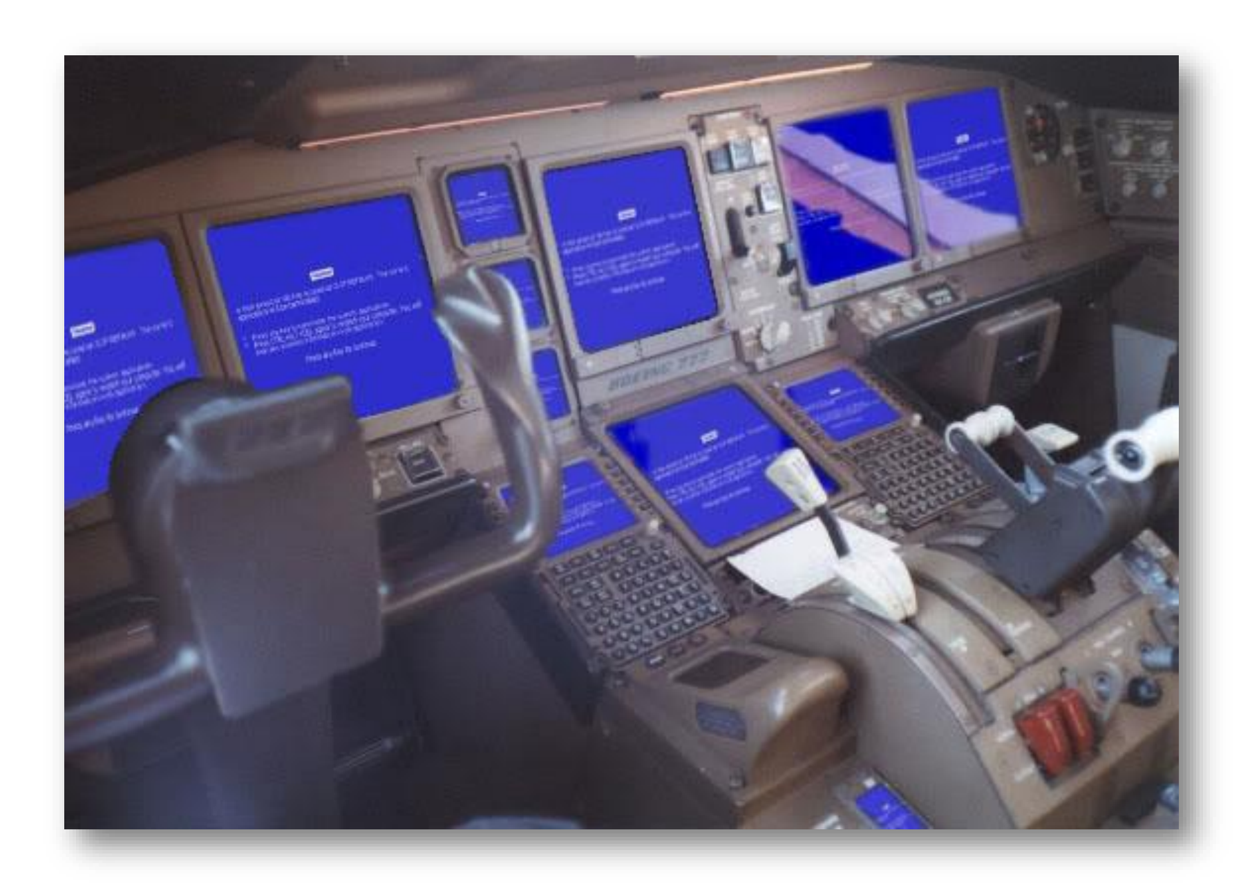
Not what you want to see at 30,000 feet.