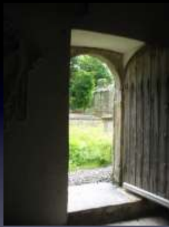
The Path to the Kingdom Matthew 5:7-10