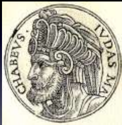
Judas Maccabaeus, The Hammer