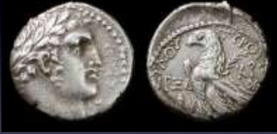
Tyrian half shekel, A.D. 22